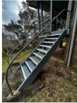
A20 stair replacement