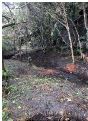
Penguin area after removal of Brush Turkey Nest and fallen tree