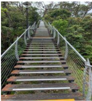
Nosing fixed to funicular stairs