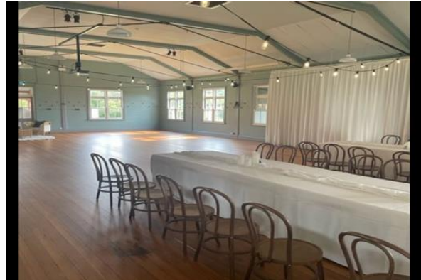
P27 after conservation work

Attached is exemption notification form lodged with the Heritage Council for the internal conservation work to P27.