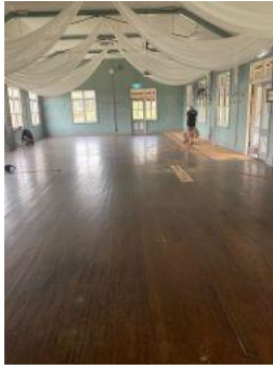
P27 floor before sanding