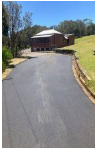
Asphalting Cottage Road