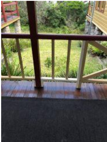
Repairs to balustrades