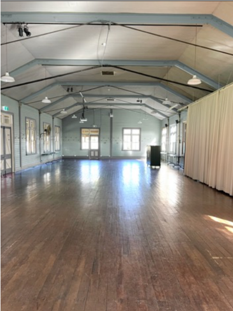
FALKLAND TIMELESS GREY - BEAMS